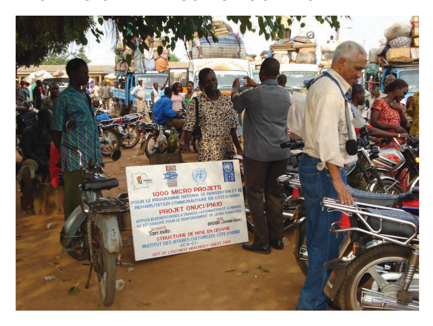
Image: Motorcycle taxi drivers project run as a part of the UNOCI/UNDP 1000 micro-projects programme in Brobo, Côte d'Ivoire.

Commander incentive programmes (CIPs), or what the IDDRS calls "special packages," support the dismantling of command structures and hence potentially more effective and sustainable DDR by providing material incentives for peace, minimizing the potential for spoilers. A key challenge in many post-conflict settings is that middle and high-ranking officers have the status and connections to engage in illicit activities and may remobilize in organized crime structures, particularly for arms and drug trade. In some cases, the potential for placing commanders and senior officers in positions of authority, including political or administrative positions (e.g. Afghanistan), or heading up reintegration programmes (e.g. YMCA