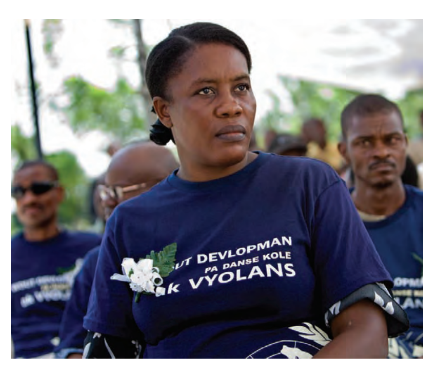
Image: A beneficiary attends the launch ceremony of the Community Violence Reduction programmes in the volatile neighbourhood of Martissant, MINUSTAH, Haiti.

Haiti, Sierra Leone and the United States provide models for reducing the risk of youth violence.