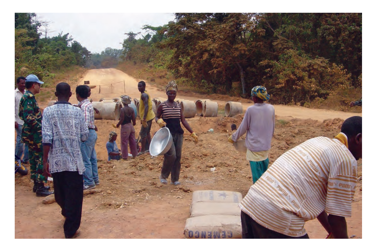
Image: An UNMIL-run labour-intensive road rehabilitation project in Nimba county, Liberia.

Consequently, it is important to note that taking one approach does not necessarily exclude the other and that DDR programmes emerging in peace operation contexts might draw