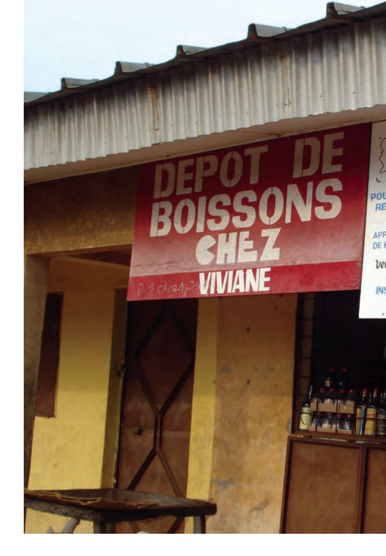
Image: A shop set up by ex-combatants under the UNOCI/UNDP1000 microprojects programme Brobo, Côte d'Ivoire.

Among the paradigm shifts is the fact that the success of a peacekeeping operation cannot be guaranteed by top-down implementation of a Security Council mandate; peacekeepers today require a more sophisticated skill set and toolkit to negotiate the local dynamics on the ground, which may not reflect the higher level agreement reached between national actors. For DDR practitioners, this has required that they: gain an in-depth understanding of dynamics surrounding groups of armed individuals; identify and understand perceived security threats and motives of the wider population for holding arms; engage in a process of periodic analysis of the situation, including national and local dynamics that is initiated early on and involves all key stakeholders; in developing specific programmes use evidence-