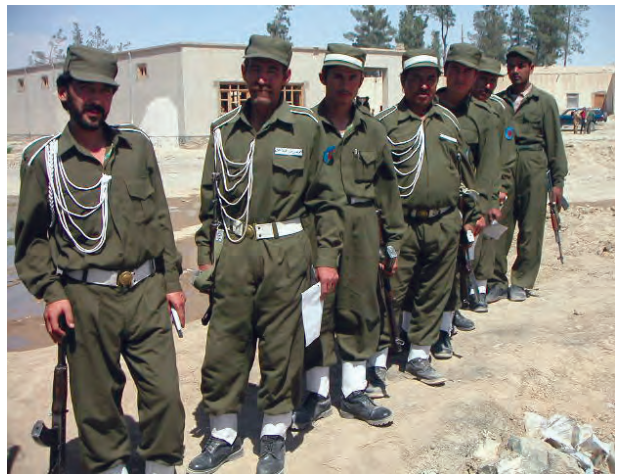
Image (top): Afghanistan New Beginnings Programme (ANBP) pilot disarmament and demobilization operations in Wardak, Afghanistan.

Image (bottom): Participants in the disarmament of illegally armed groups (DIAG) programme in Kandahar, Afghanistan.